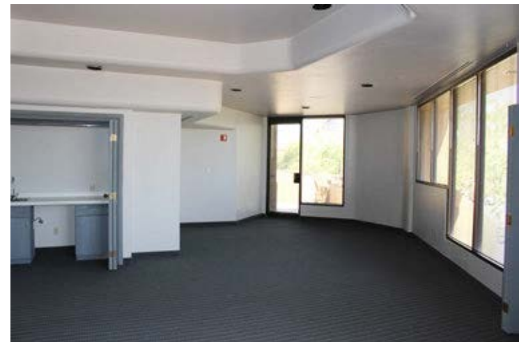
Storage Room. Plenty of Flex Space with Appealing Details!