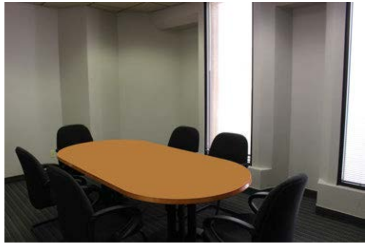
Warm, Welcoming Lobby with Common Area Conference Room